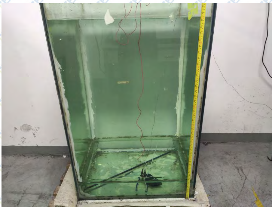
Photo 4 IPX8 test