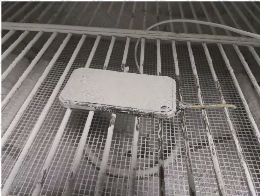
Photo 3 IP6X test